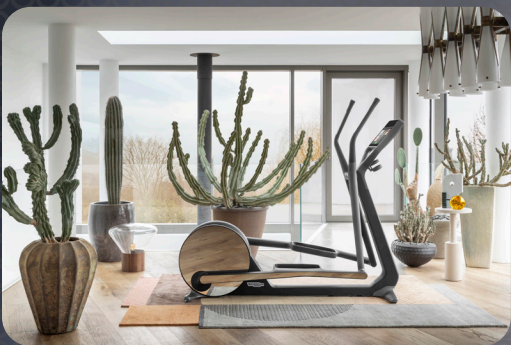
Cross personal - Design Cross Trainer Designed by Antonio Citterio for Technogym Value $16,950