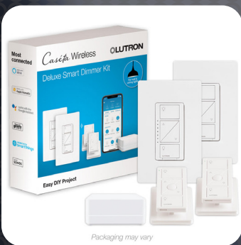
Lutron Caseta Wireless Deluxe Smart Dimmer Switch Kit Value $267