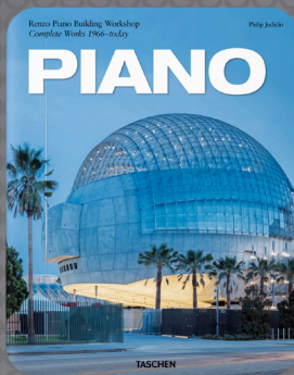
Book: Piano. Complete Works 1966-Today Value $90