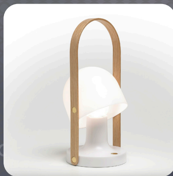
Follow me Portable Indoor/Outdoor lighting, Designed by Inma Bermúdez for Market Value $495