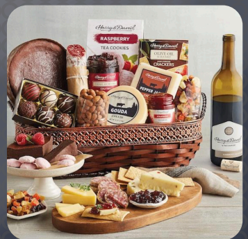
Gourmet Food and Wine basket Value $300